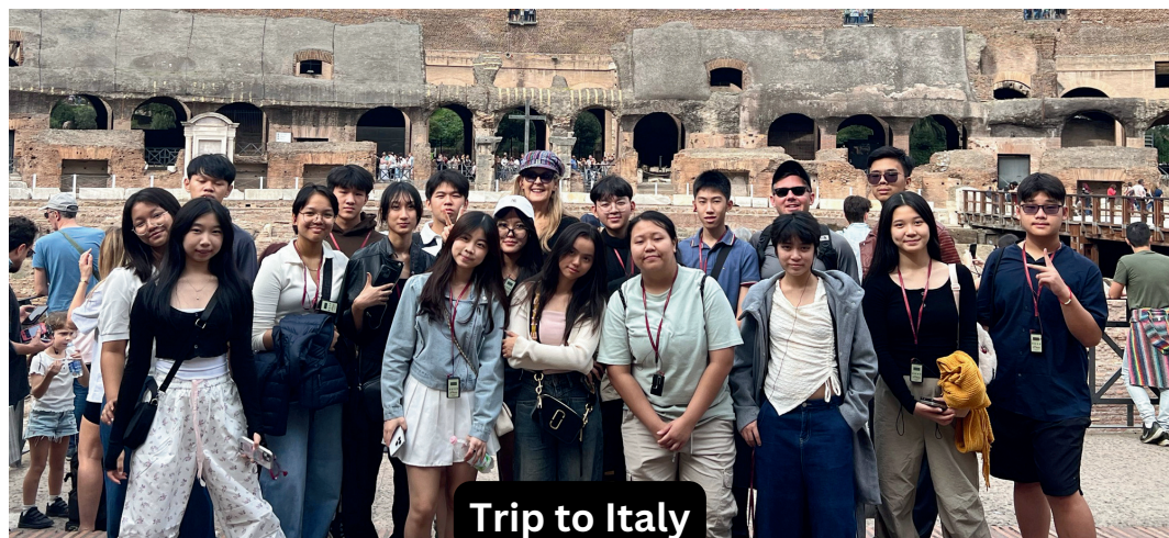
Trip to Italy