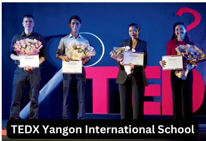
TEDx Yangon International School