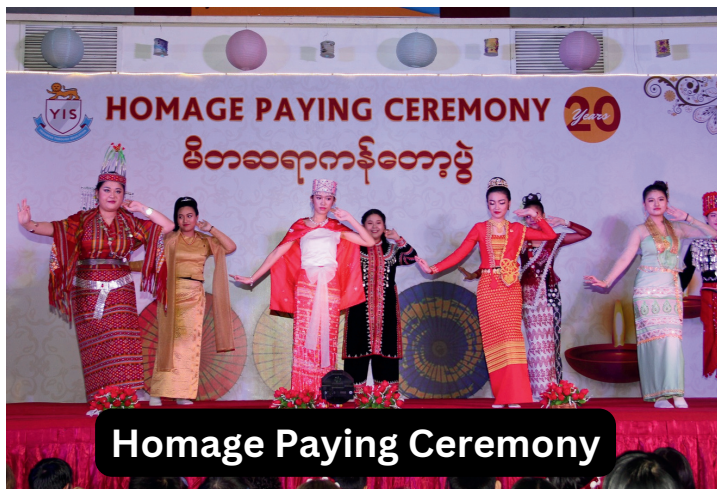
Homage Paying Ceremony