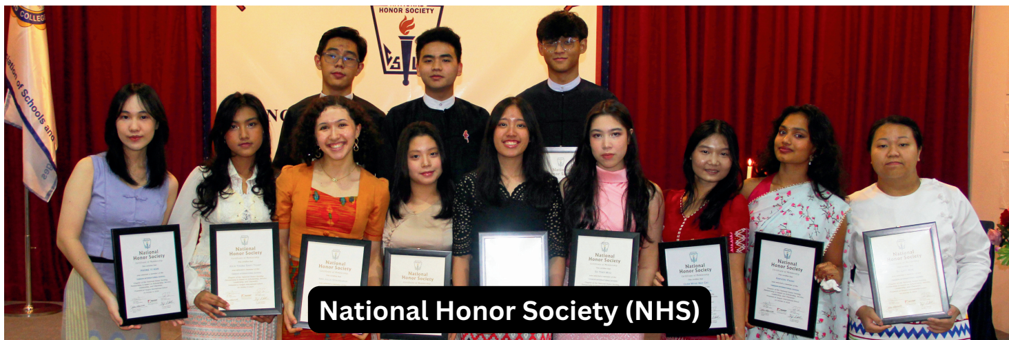
National Honor Society (NHS)